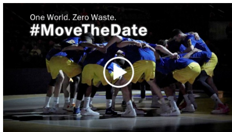
Download: video file